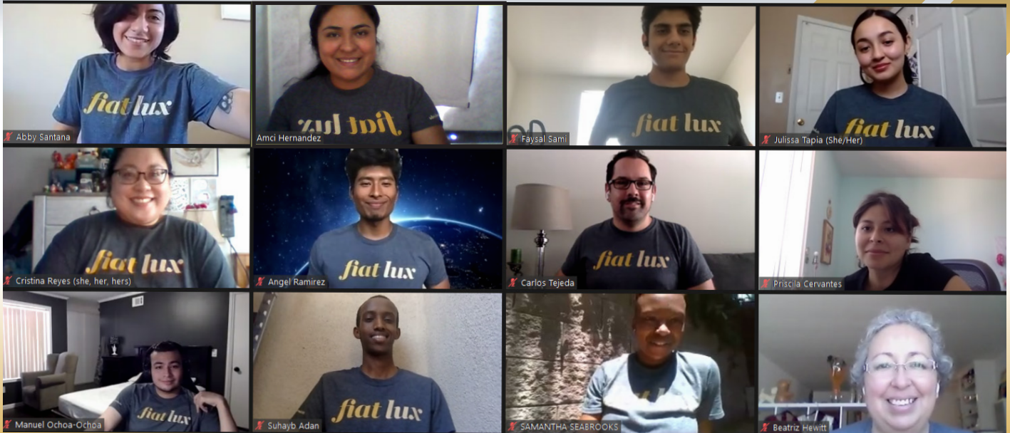
Chancellor's Associates Scholars at a live zoom meeting this year.