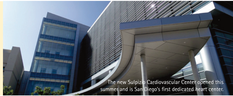
The new Sulpizio Cardiovascular Center opened this summer and is San Diego's first dedicated heart center.

In just four decades, UC San Diego Health Sciences has had a profound impact on health care by translating basic laboratory findings into lifesaving medical and surgical care.